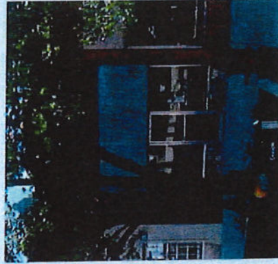
LOCATION A: FRONT OF BLDG ON MAIN ST.

One sign installed on building front on Main St. and one sign installed on rear of building near parking area.