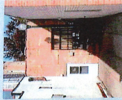
LOCATION B: REAR OF BLDG NEAR PARKING